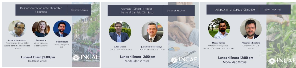
Promotional posters for the talks