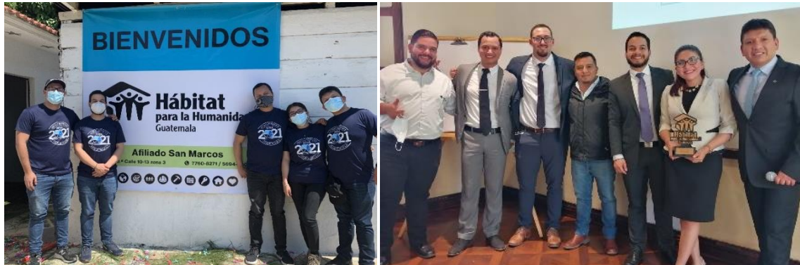
Consulting group that carried out its MCP with Habitat for Humanity of Guatemala

The beneficiary organizations for the Strachan Chair were Teensmart International and Habitat for Humanity Guatemala. Through these consultancies, our students helped the organizations with digital marketing and promotion issues, as well as with internal process improvement.