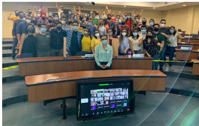
Group photo of the MBA in the ECOFILTRO case session.