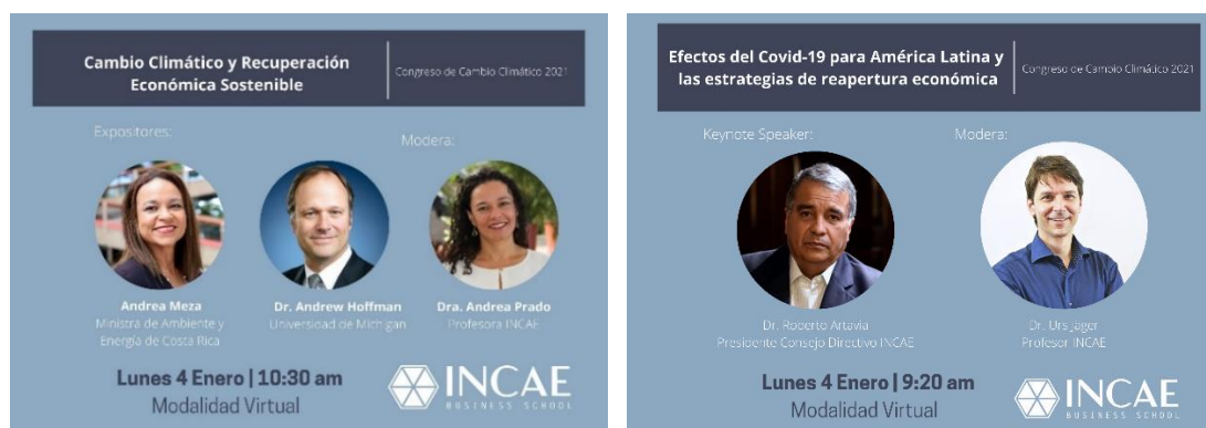
Promotional posters of the initial conferences